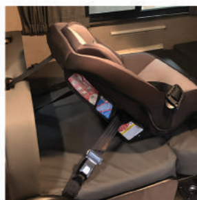
WHEN CHILD SEAT IS BEING INSTALLED. TETHER AND LAPBELT ATTACHED (BUT NOT CINCHED)