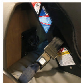
RUN LAP BELT THROUGH BACK OF CAR SEAT AND SECURE. TIGHTEN AS NEEDED.